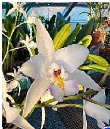
Laelia albida var. semi-alba