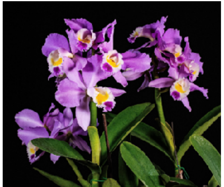
Cattleya Dubiosa 'The Boss'

Certificate of Cultural Excellence, 91 Points