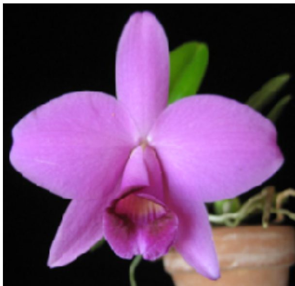
Laelia praestans 'Diamond Orchids' HCC-AOS