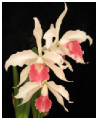
Laelia purpurata var carnea