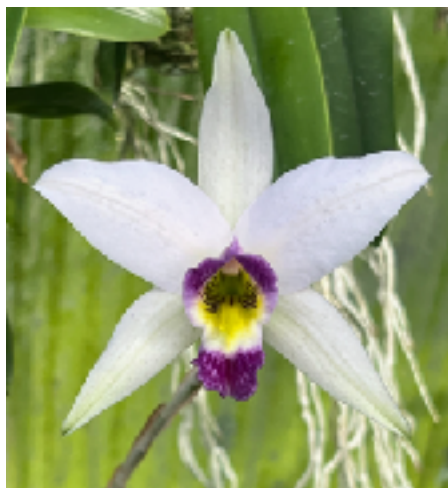
Laelia anceps var. coerulia 'B.R.O.'