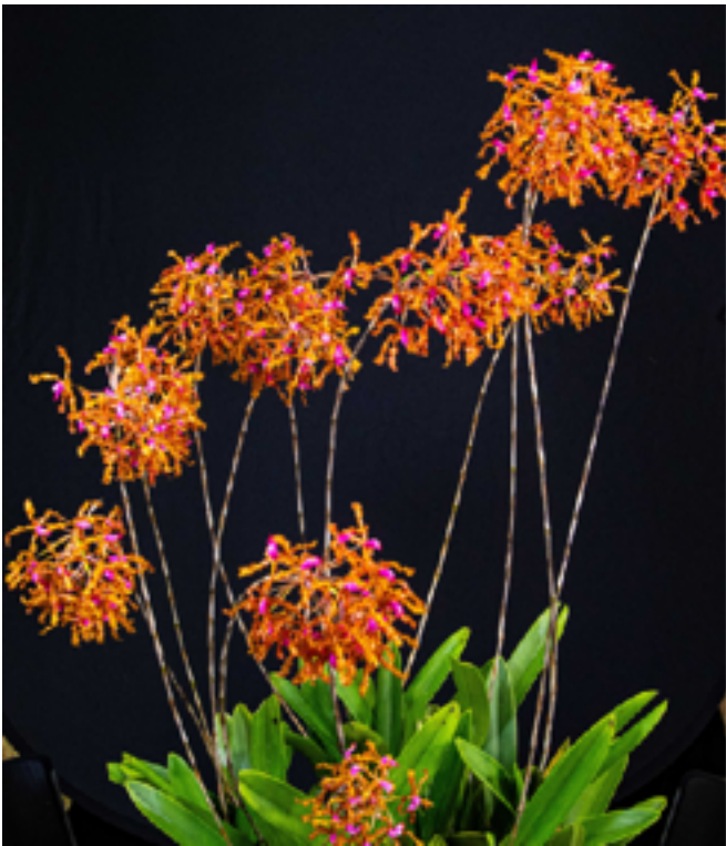
Laelia colombiana 'Courtland'

There were 2 orchids presented for judging. Two (2) were awarded. One entry received 2 awards.