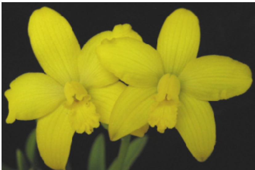
Laelia briegei 'Florence'