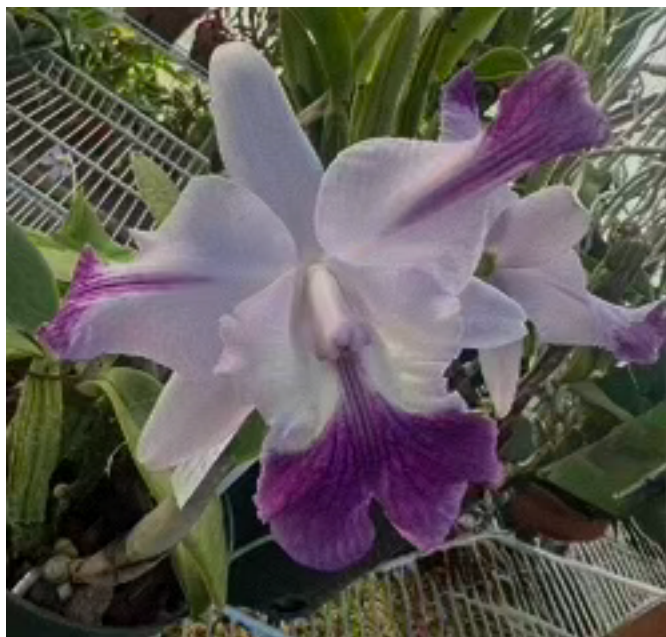
Lc. Moonlight Dream 'SVO Moonlight Kiss' AM/ AOS